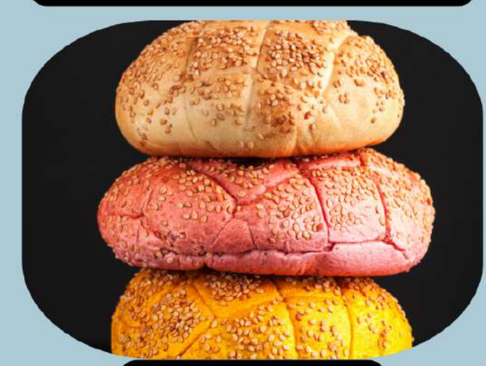
Bread and Dough