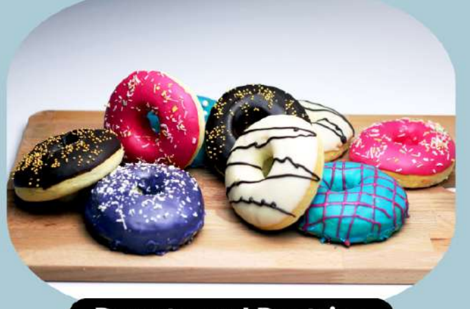
Donuts and Pastries