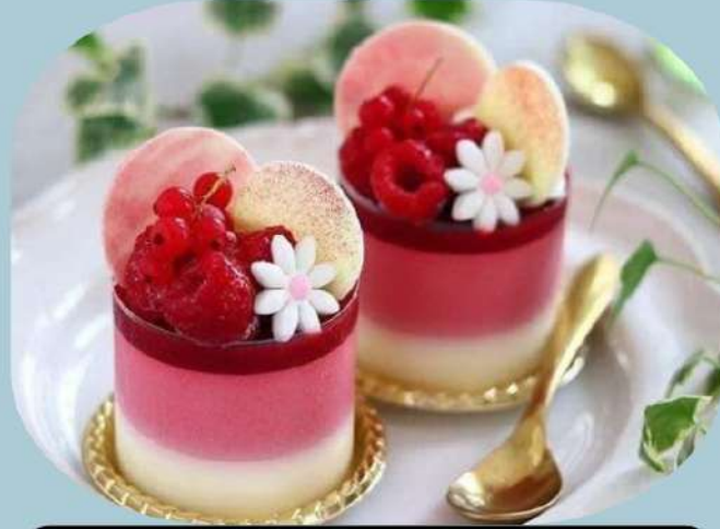
Mousse and Cream Desserts