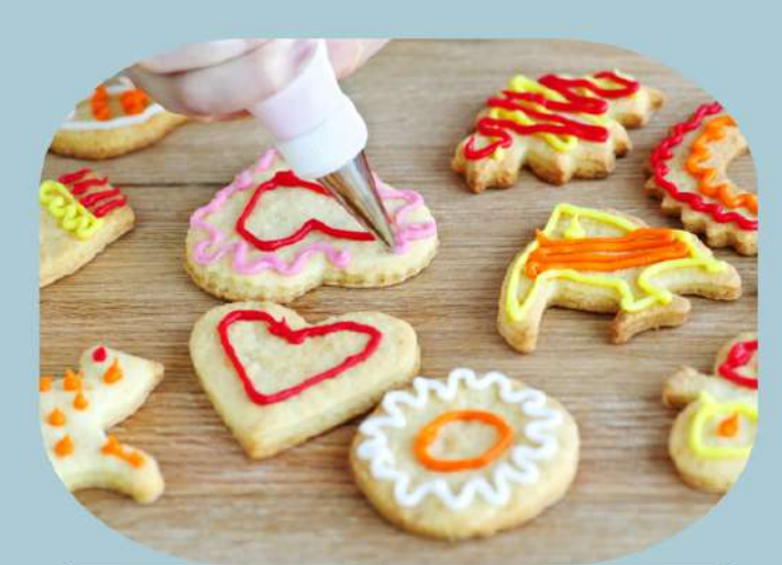
Cookie and Biscuit Decoration